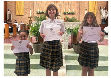
Crusaders of the Month (April)