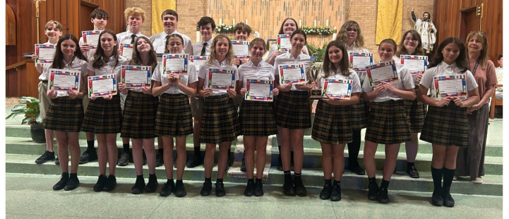
Model UN Distinguished School