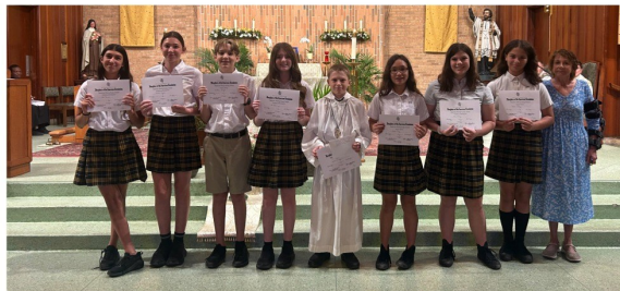
DAR Essay winners