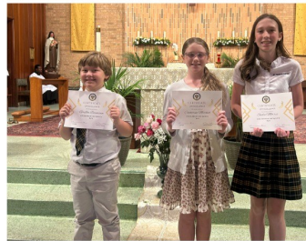
Crusaders of the Month (May)