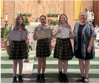
Poetry Contest winners