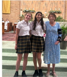
Kiwanis Essay winners