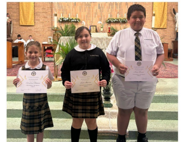
Crusaders of the Month (March)

We celebrated our students at a recent awards ceremony with Crusader of Month for March, April, and May, Model UN, essay contest, poetry contest, and Lux Mundi essay awards. We are so proud of our students, awards for Crusader of the Month for March, April, and May, Model UN, the essay contest, the poetry contest, and the Lux Mundi essay teachers! who work hard every day to accomplishment great things.